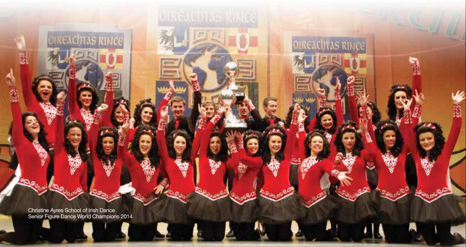
Christine Ayres School of Irish Dance Senior Figure Dance World Champions 2014