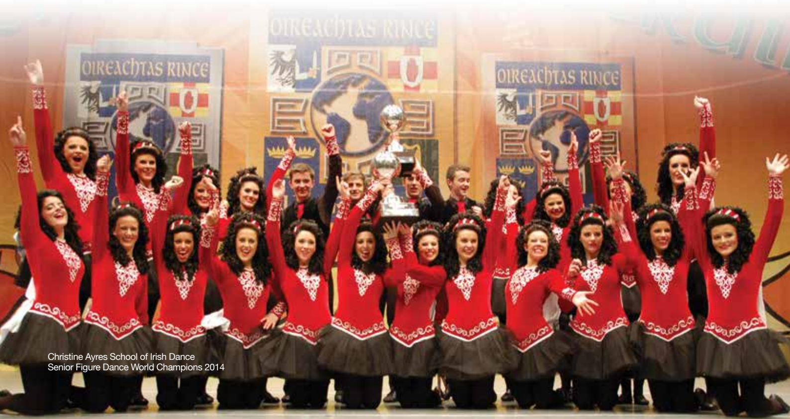
Christine Ayres School of Irish Dance Senior Figure Dance World Champions 2014

BÍ LINN ANOIS (Gaelic) JOIN WITH US NOW!